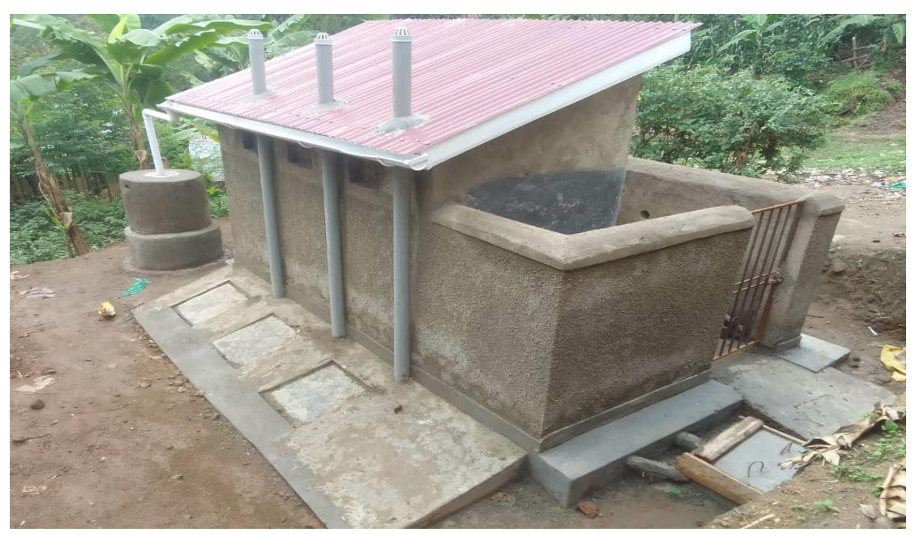
Itimbwa 3 stance composite latrine under construction