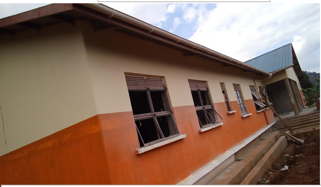
Maternity Ward at finishes at Bunamono Health Centre III