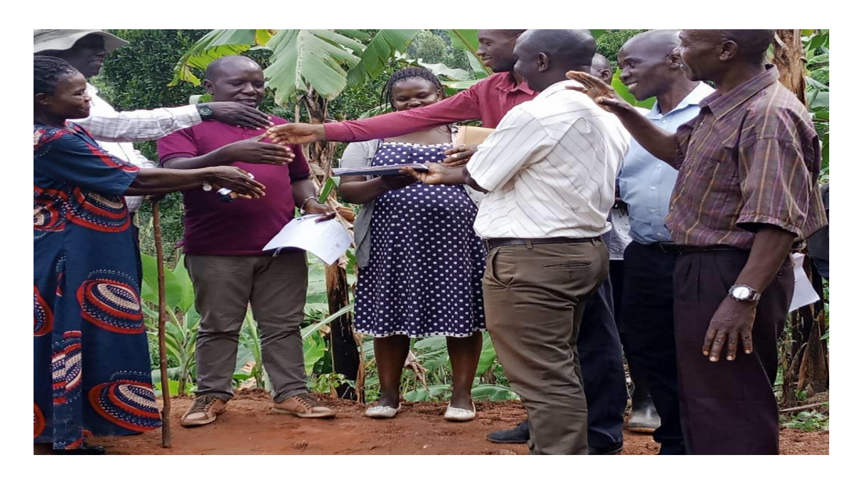
Deputy RDC, DISO, Vice Chairperson LCV and Area Leaders at the Official Launch of the Construction of Muchomu RGC Composite Latrine in Bumayoka Sub County.