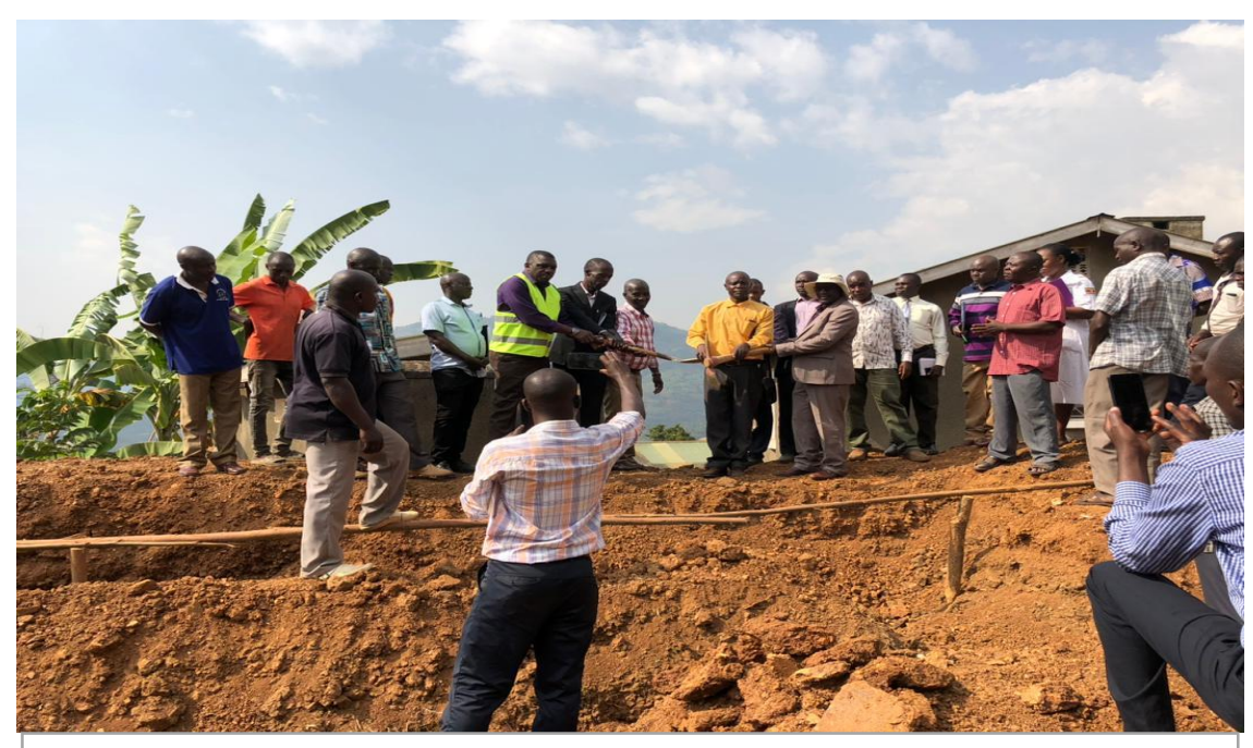
RDC and District Chairperson at the Nakokolo GFS Official Launch in Nalwanza Sub County