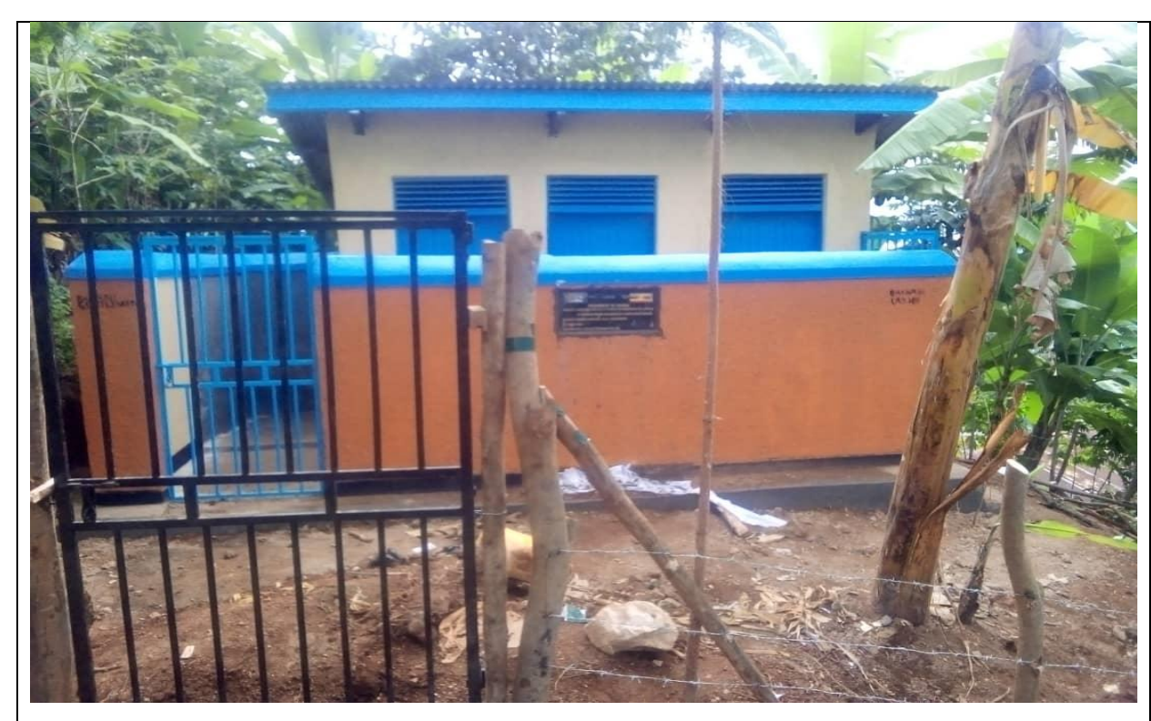
Bunango Rural Growth Centre Composite Latrine completed

The following existing 4 Stance and 3 Stances VIP composite latrines of Nalufutu in Bukigai sub county and Bukari in Bukibokolo Sub county were rehabilitated.